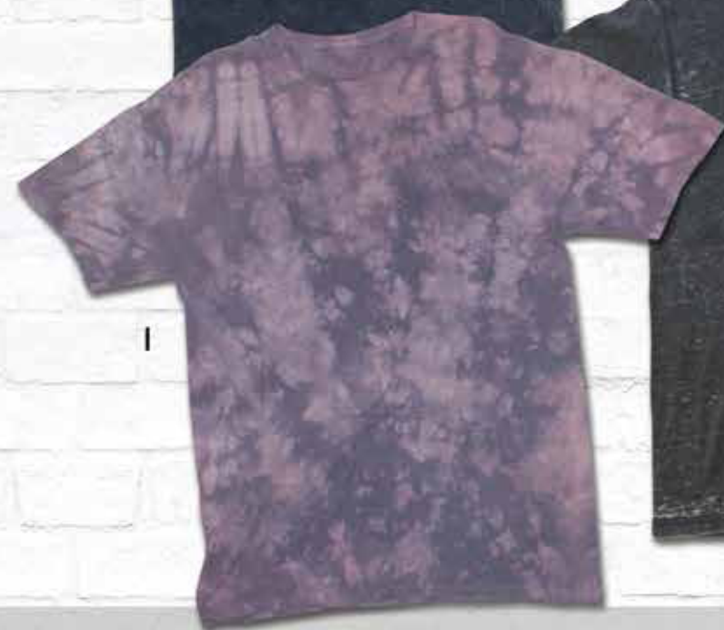
F. Dip dyed cotton tee G. Acid wash cotton tee H. Marble wash cotton tee